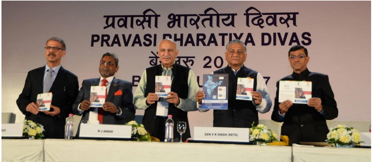
Release of ICM's Booklet on Welfare and Protection of Indians Abroad at Pravasi Bharatiya Divas, 2017, Bengaluru